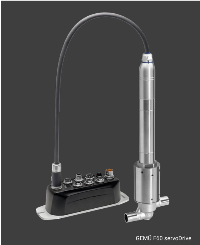
GEMÜ F60 servoDrive