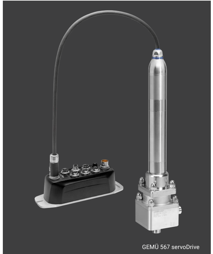
GEMÜ 567 servoDrive

Do you still use high-maintenance piston or peristaltic pumps for filling? Do you have to contend with pressure fluctuations or control inaccuracies in your process?